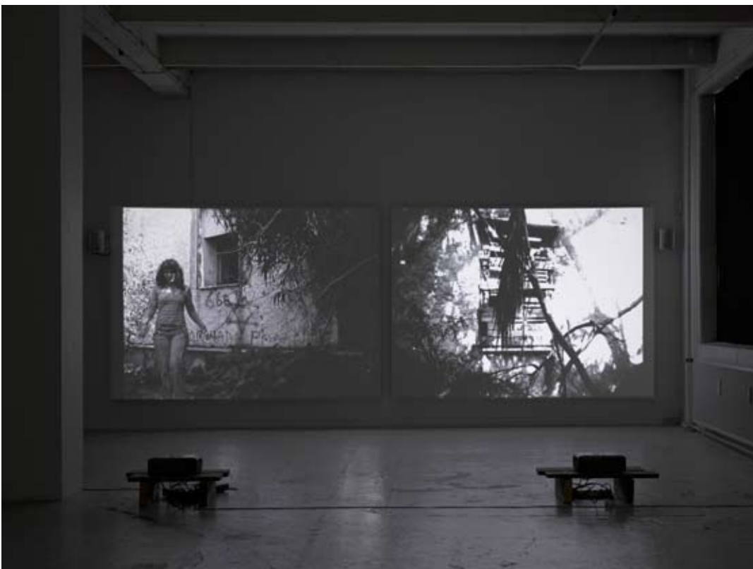
One + One + One , 2006 Double video projection, 16 mm transferred into video, black & white, sound, 5'03'' et 6'