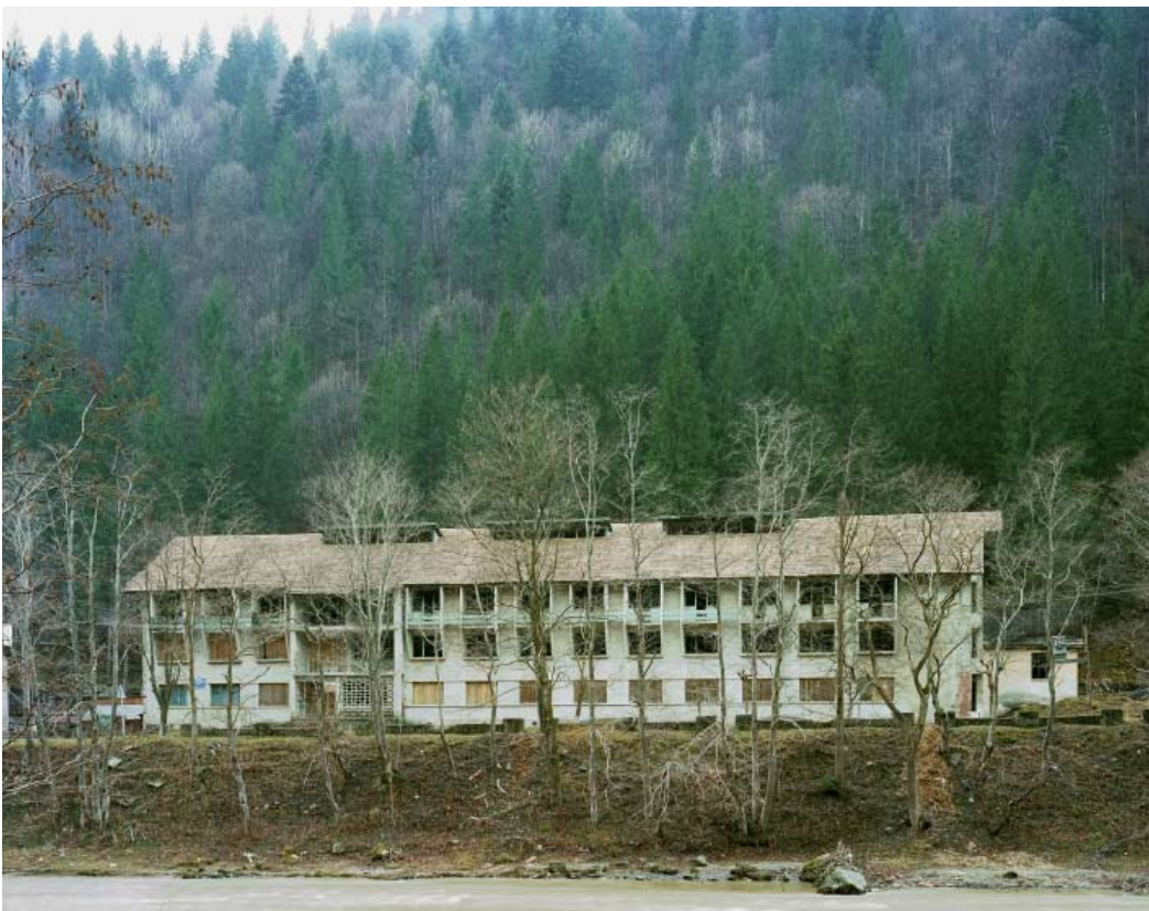
From the Travel of Jonathan Harker, 2003 Silver gelatin print